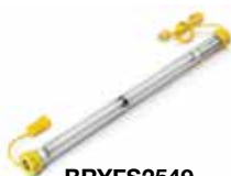
BRYFS2549 Straps not Shown